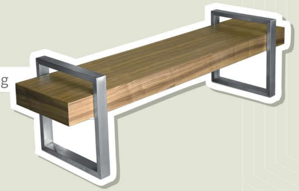
Gazebo & Seating