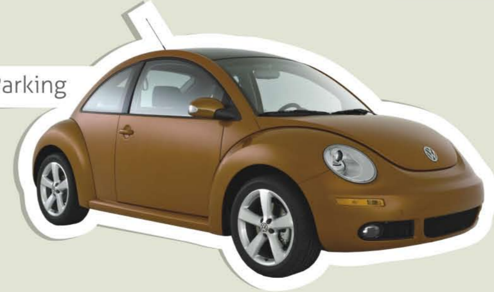
Ample Car Parking