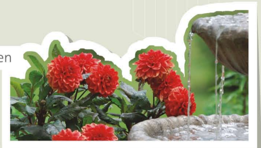
Water Bodies & Garden