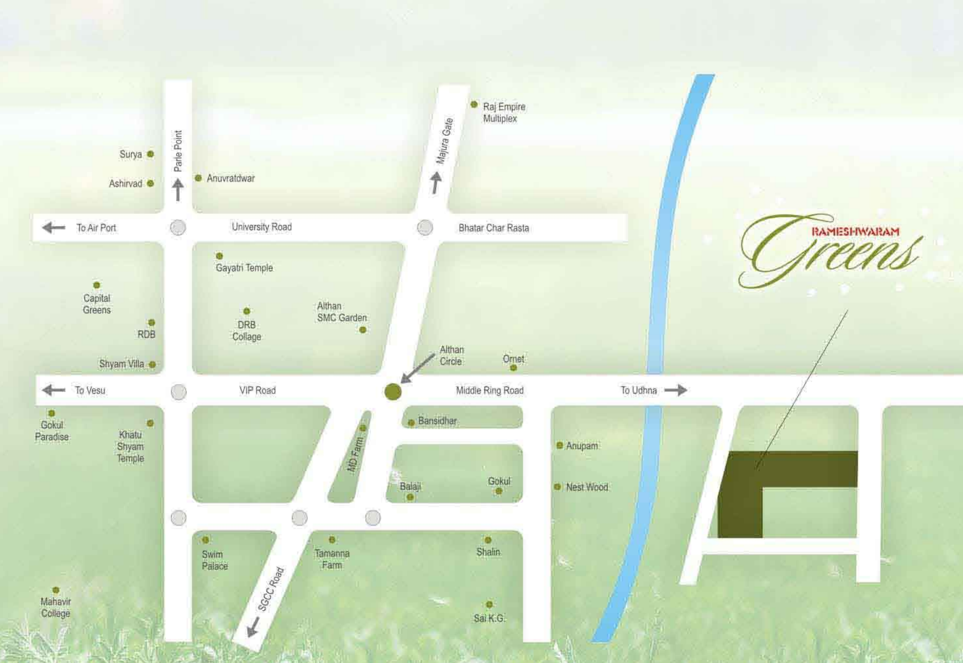
Key Plan (Not to Scale)

The gateway to heaven is carved with innocence and bliss!