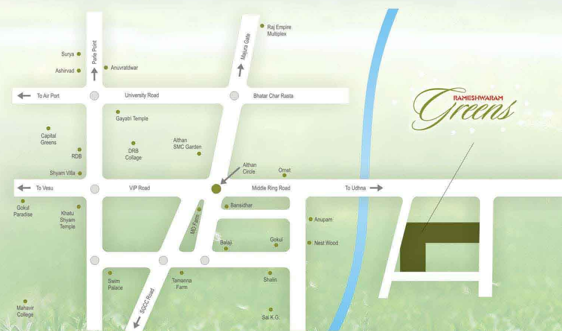
Key Plan (Not to Scale)