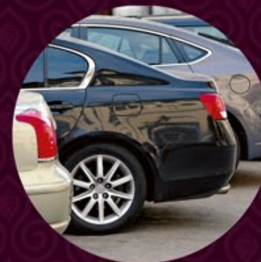
Spacious Visitor Parking