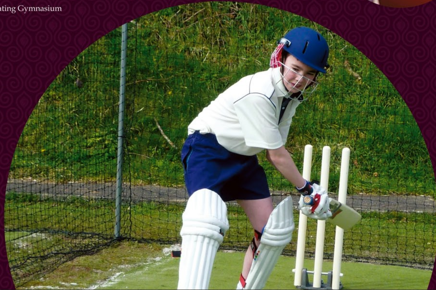
Energetic Lawn Tennis Comprehensive Net Cricket Swift Skating Rink