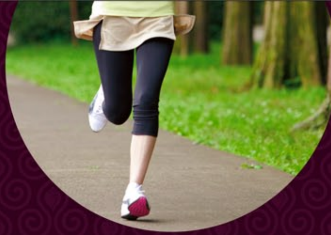
Smart Jogging Track Agile Cycling Track