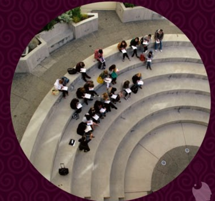
Magnificent Multipurpose Court Amazing Amphitheater