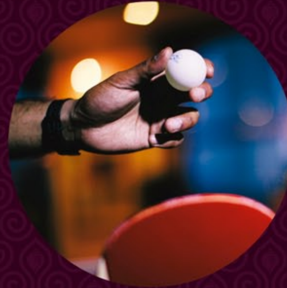
Compact Carom Room Tensile Table Tennis Classic Card Room